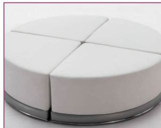
Four-Piece Coco Ottoman

L: 41.7" (rounded side) D: 29.5" H: 17.5" ded side) D: 29.5"