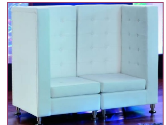
High Back Love Seat

Love Seats can be made with High Back Corner Chairs or Corner Chairs.