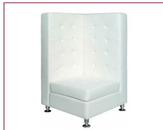
High-Back Corner Chair

L: 22" W: 28" H: 52.3" Seat Depth: 22" seat Height: 17.3"