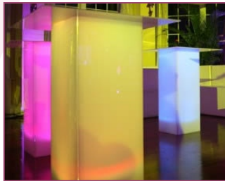
LED High-Boy Table

LED High Boy Tables can be used for many purposes- as a cocktail table, sales display and more. Choose one color for the light or let it change colors. Best effect in dim lighting