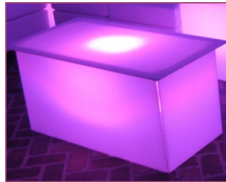
LED Coffee Table

LED Coffee Tables can change color or stay one color during your event. A coffee table is the best option for your guests to place food and drinks in a lounge setting.