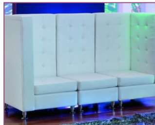
3 or 4 Piece High Back Couch

L: 28" W: 28" H: 52.3" Seat Depth: 22" Seat Height: 17.3"