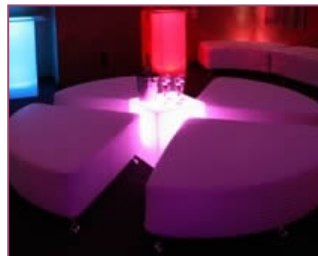
LED Cube & Coco Ottoman Combo

This combo can be arranged as pictured, or adjusted to fit your needs. The Coco Ottoman and Cube ottoman allows for ample seating and the cube provides a space to place drinks.