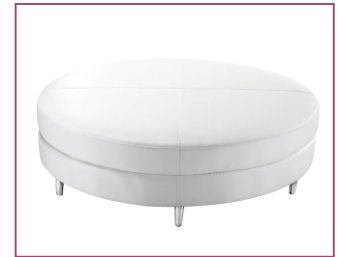
60-inch Round Ottoman

L: 74" D: 22" H: 17" Seating Depth: 22" Seating Height: 17" From Tail End to Outside Curve, Approximately 37"